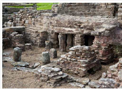
Ruins at Vindolanda Roman fort in England

The Romans invented or developed many things that are still used today. They designed a system of underfloor heating to keep homes warm. They developed a drainage and sewerage system. The Romans built many roads, some routes that are still used today. They also built stone forts and walls for defence, such as Hadrian's Wall and the fort at Vindolanda. Roman baths and aqueducts made of stone are still standing. The Romans brought in coins called denarii to buy things. The calendar we use today is based on the Roman calendar, with July and August being named after Julius Caesar and Emperor Augustus.