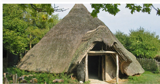
Recreation of a Celtic roundhouse in Dorset

The Celts were tribespeople who lived in England and across most of Europe over 2000 years ago. In Britain, there were many tribes of Celts, each with its own king. They were often at war with other nearby tribes. Celts lived by farming, hunting and gathering. They built roundhouses made from wattle and daub with thatched roofs. Most Celts farmed the land and kept animals, but there were also skilled craftsmen and blacksmiths. They made jewellery using glass beads and pots from clay.